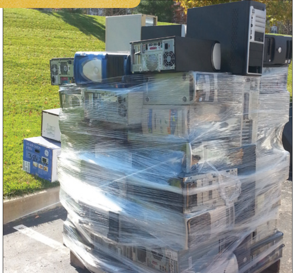
Electronics collected at Recycles Day last year are saved from the landfill.