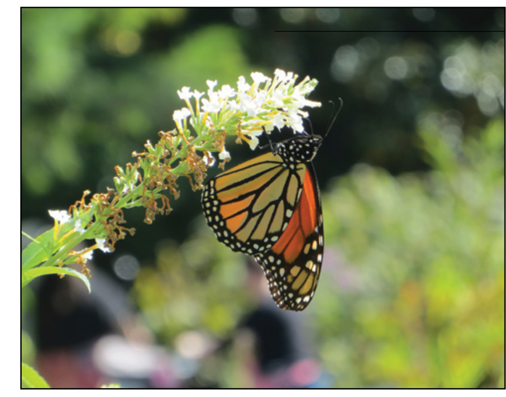
Monarch butterfly making a cameo at the Butterfly House last summer.

March 10, 17, 24, 31 April 7, 14, 21, 28 May 5, 12, 19, 26 Tuesdays, 10:30 a.m. Included with general admission.