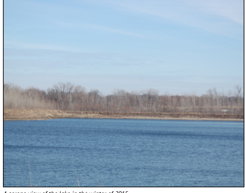
A serene view of the lake in the winter of 2015.

the western end of the parking lot. Parking is in the shared parking lot of the outlet mall The park received a Municipal Parks Grant through St. Louis County. The grant offered assistance to build the crushed rock trail around the park, a 25' x 25' pavilion, a ramp and boat dock for easy access to the lake. The total grant cost was $297,384 and will cover $272,000 with a city match of $25,384.