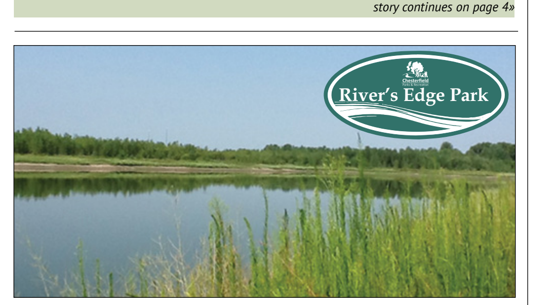
River's Edge Park Grand Opening offers outdoor activities for all ages.

The District's purpose is to provide sustainable capital for qualifying energy efficiency projects in communities across the state of Missouri. When municipalities join together, they create a broad base of demand for capital and therefore an opportunity for economies of scale resulting in a reduced cost of borrowing for property owners. One of the most attractive aspects of the program to members is cooperation among communities which becomes a gateway to the lowest possible cost in terms of interest rates available.