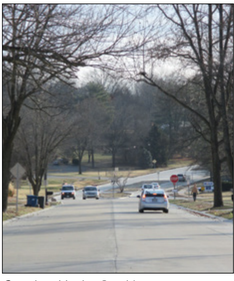
Completed Ladue Road improvements.