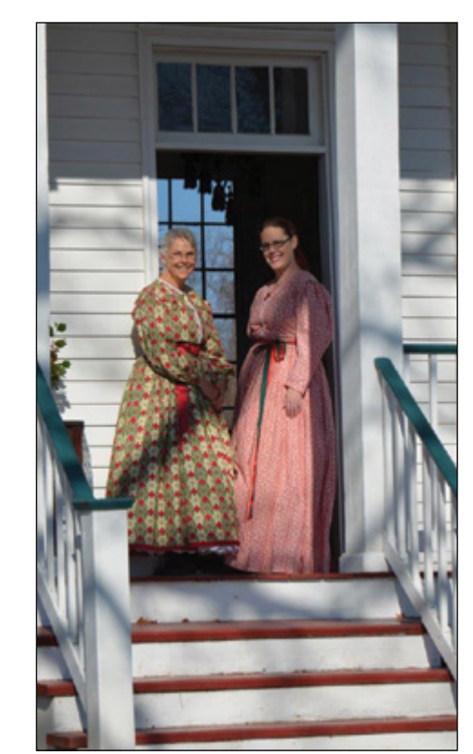
Greeting visitors on the Thornhill porch.