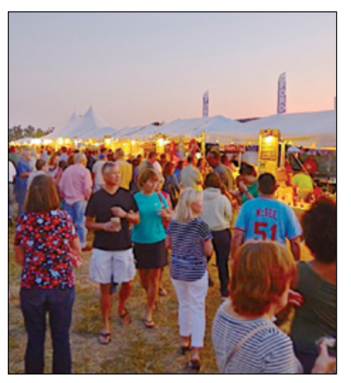
Over 200,000 people attended the three-day festival last September.

Dated Material: Please deliver by March 13, 2015