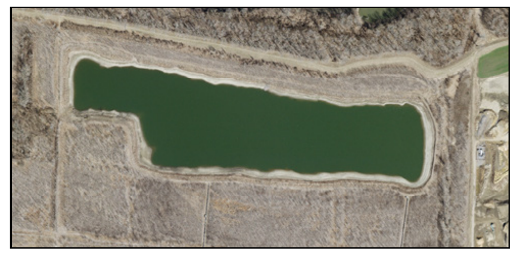
Aerial view of the lake at River's Edge Park.

A park shelter was installed in early 2015.