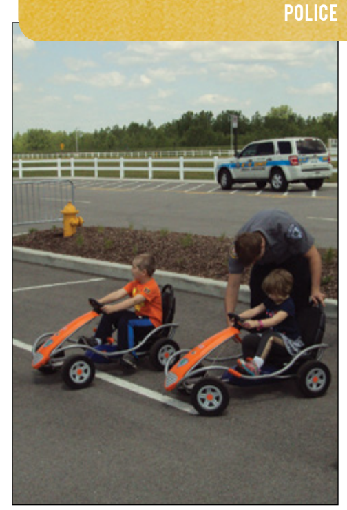
Safety Town interactive demonstrations.