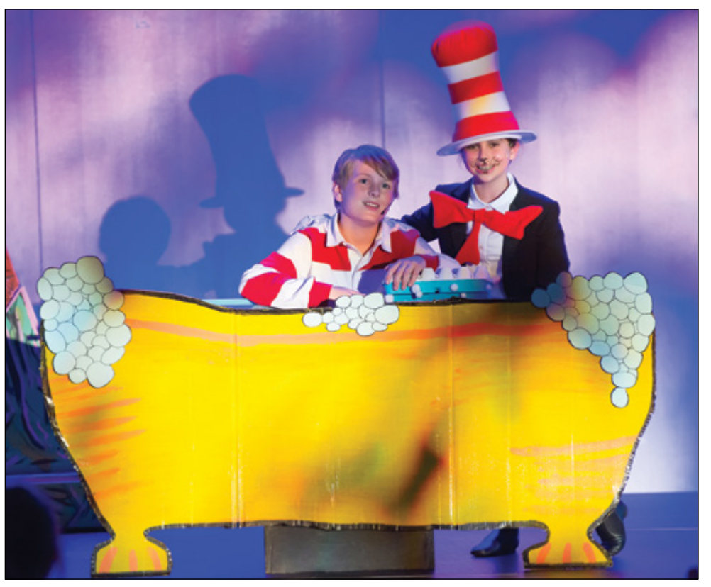
Seussical: Theater based on the books of Dr. Suess.

The Academy also has open registration for the Spring 4th Quarter Session, March 2–May 2, featuring classes for all ages, including the Musical Theatre Exploration classes "Heroes and Villains" (grades K–4) and "A Whole New World" (grades 5–8), along with Beginning Musical Theatre, Scene Study Studio, Improv and more.