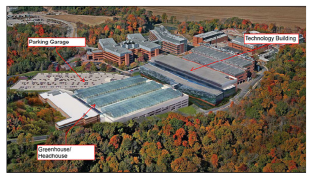
Construction of the Technology Building is planned to begin soon.